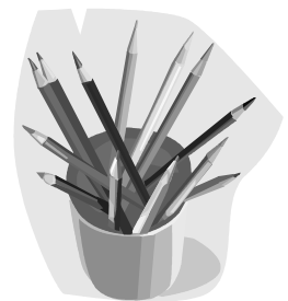
The Art Club meets in room 205. Listen to announcements for meeting dates and times.

believes that one of the most rewardig aspects of being the advisor of the art club is having the opportunity to work closely with students she might not normally get to see otherwise.